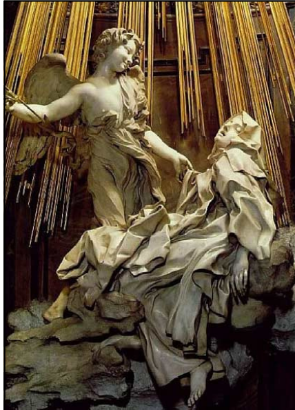
The Ecstasy of St Teresa of Avila Feastday: October 15 th

Catholics are attracted to St Therese's style. Her "little way" puts holiness of life within the reach of ordinary people. Live out your days with confidence in God's love for you. Recognize that each day is a gift in which your life can make a difference by the way you choose to live it. Put hope in a future in which God will be all and love will consume your spirit. Choose life, not the darkness of pettiness and greed. St Therese knew the difference love makes by allowing love to be the statement she made each day of her life.