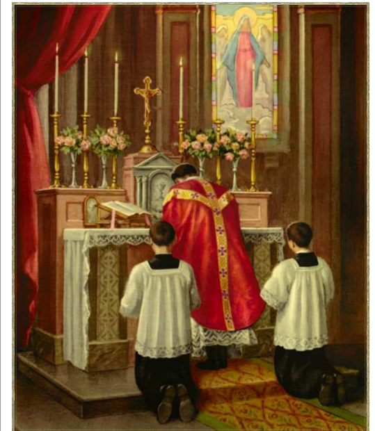
The Priest's Communion