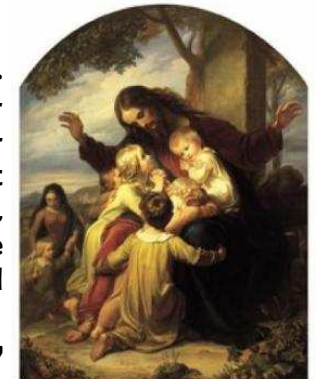
Let the Little Children come to Me!

J esus loves all the children of the world. Yet there are many children who suffer from terrible things, such as sickness, poverty, ill-treatment, neglect and religious ignorance. In this time of Lent, pray for all those children who do not have the chance that you have, to be Catholic and to have been born in good families.